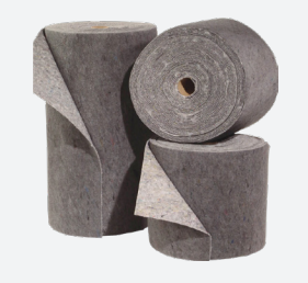
Economy Rag Rug